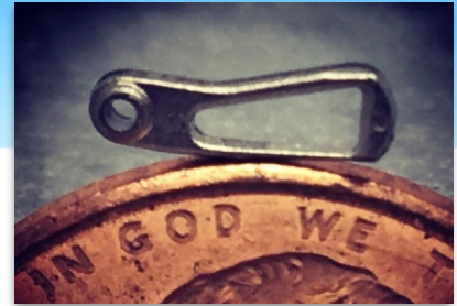
COBALT CHROME - MIM

This type of material dissolves or is absorbed by the body and can become part of the bone for a much stronger fix, and never needs to be taken out of the body.